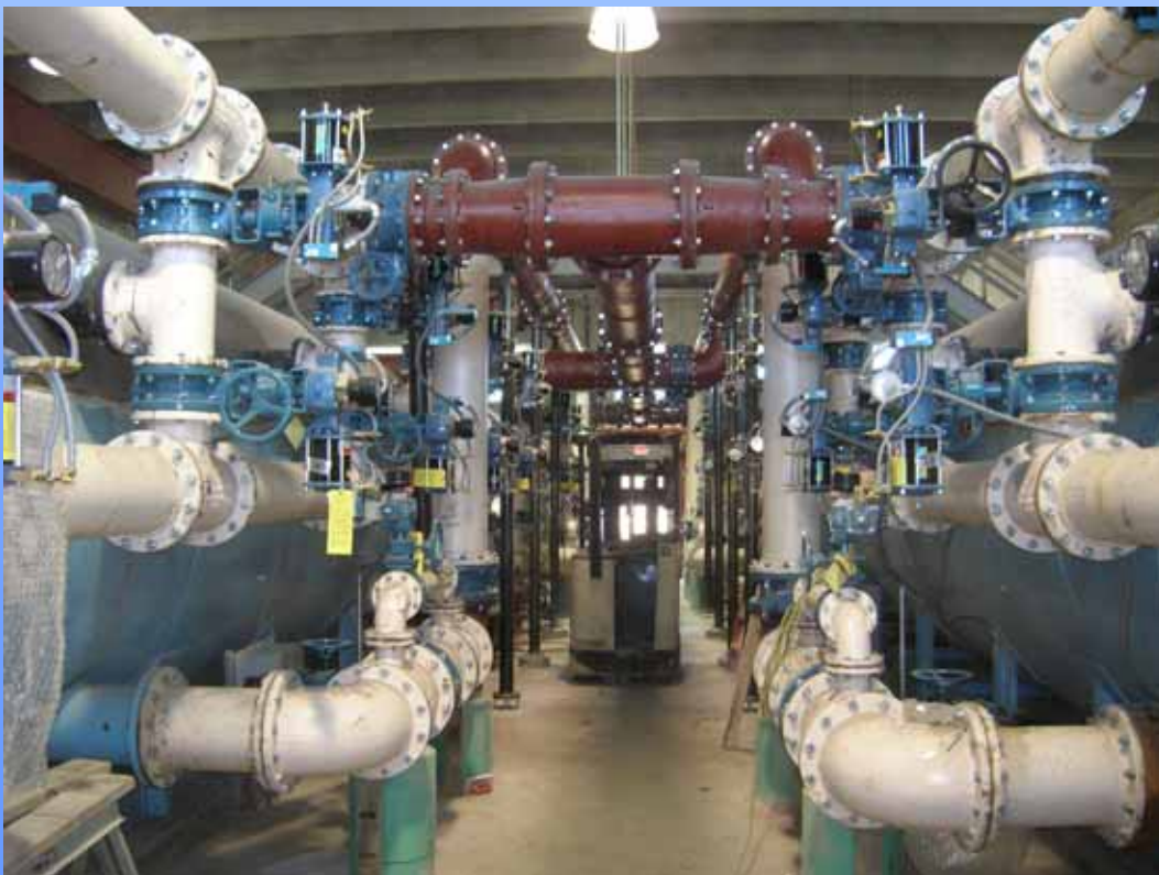
Water Treatment Process Piping, Delano Water Treatment Facility

Some people may be more vulnerable to contaminants in drinking water than the general population. Immuno-compromised persons such as persons with cancer undergoing chemotherapy, persons who have undergone organ transplants, people with HIV/AIDS or other immune system disorders, some elderly, and infants can be particularly at risk from infections. These people should seek advice about drinking water from their health care providers. EPA/CDC guidelines on appropriate means to lessen the risk of infection by Cryptosporidium are available from the Safe Drinking Water Hotline at 1-800-426-4791.